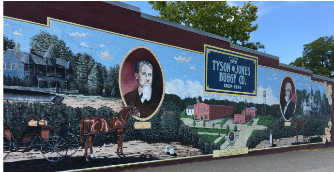
"The Tyson & Jones Buggy Co. 1850 - 1929" One of several murals in Carthage depicting the history of the town and Moore County.

In January 2021, the Rural Planning Program (RPP), part of the N.C. Department of Commerce's Main Street & Rural Planning (MS&RP) Center, launched CERRI in response to the economic challenges small towns and rural communities have faced due to the COVID-19 pandemic. CERRI provides participating communities with a planning process to develop local strategies for economic recovery and technical services for strategy implementation. Key steps include conducting a community assessment, developing an economic recovery plan of work, and delivering implementation services to help communities support small businesses and build local economic resiliency. Initially, the RPP engaged ten communities, across North Carolina's eight Prosperity Zones, in CERRI (as shown on the map below).