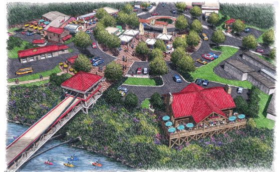
Uptown Jonesville Concept Rendering