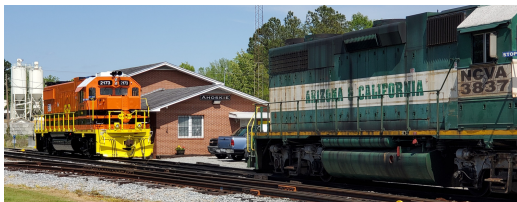
North Carolina & Virginia Railroad Co., Inc. Headquarters in Ahoskie