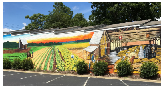
"When Tobacco Was King"

The RPP looks forward to the first CERRI meetings in Hudson, Jonesville, Pamlico County, Raeford, Rose Hill, and Warren County in the second quarter of 2021. Dallas will begin its CERRI work in late summer and Mars Hill will follow. To prepare for the initial meetings, the communities are establishing local work groups and identifying stakeholders while RPP staff members are meeting remotely with local CERRI project coordinators, preparing surveys, compiling data, and reaching out to project partners.