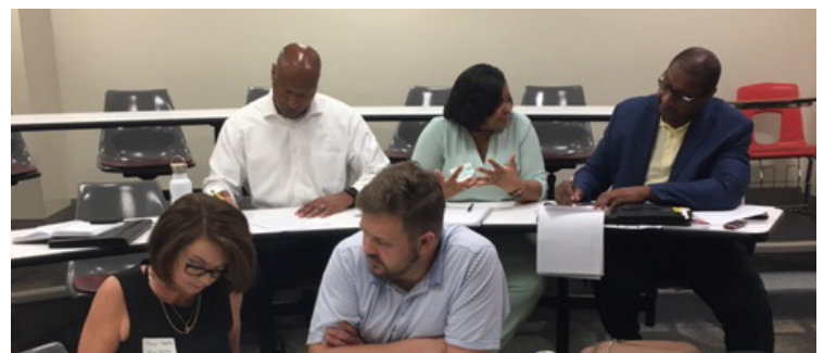
RC2 participants from China Grove, East Spencer, and Marshville worked with the Rural Planning program on project development.

The Leverage NC website has an archive of recordings of past webinars ( www.leveragenc.org ).