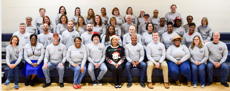
Team REDD during its holiday retreat. Team REDD Rocks!

In FY 2023, Governor Cooper announced 105 RTGF grant awards totaling $48 million in support of rural projects.