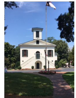
Historic Courthouse in Dallas, the initial Gaston County seat of government.

The CERRI work group for the Town of Dallas began meeting in the last quarter of 2021. During its first two sessions, the work group identified local economic drivers and assets and completed a SWOT analysis. RPP staff surveyed work group members, the local government, and Dallas businesses, and interviewed community stakeholders. The work group's next task is to select issues and topics it wants to study further before developing economic strategies.