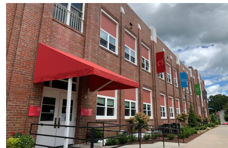
Hudson Uptown Building (HUB) Station, a former school campus owned by the Town of Hudson, houses an arts center and a business center.

The RPP appreciates the support its partners provided in 2021 for CERRI and the initial 11 communities involved in the new initiative.