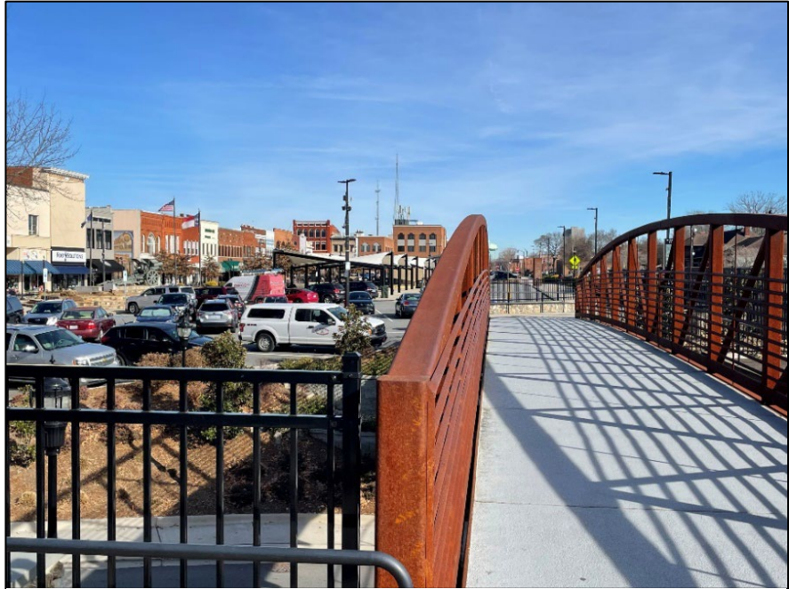
The Hickory Trail spans 10 miles across the city connecting various neighborhoods and commercial districts, including downtown. The trail promotes cycling and pedestrian safety, while connecting popular destinations and amenities, which advances economic development and creates desirable quality of life for residents and visitors.

All elements associated with outdoor recreation combine to develop an ecosystem where each component helps to strengthen the potential for growth of the local and regional outdoor recreation economy.