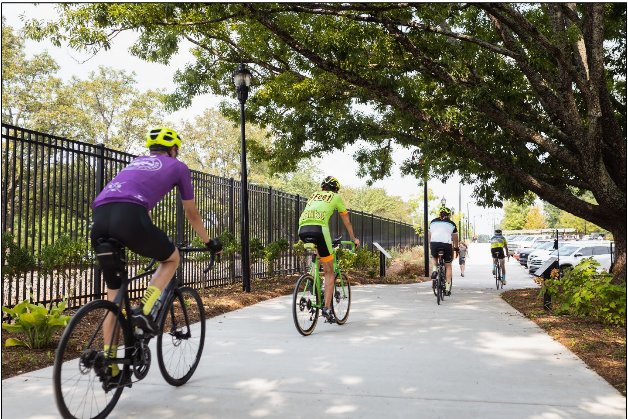
Cyclists enjoying the Hickory Trail which, when complete, will connect popular destinations and amenities including downtown, the Riverwalk, the Aviation Walk, Historic Ridgeview, and the OLLE Arts District.

Hickory, located in the foothills of the Blue Ridge Mountains, is building upon a tradition of craftsmanship to enhance the city as the regional center of an outdoor recreation economy that creates quality jobs, supports business development and entrepreneurship by emphasizing a high quality of life, embracing a spirit of community collaboration, and fostering outdoor recreation culture.