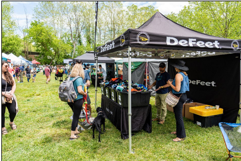
DeFeet tent at the Outdoor Business Alliance's 2024 Get in Gear Fest.

One idea that emerged is to promote unique, high-quality goods made locally and publicize distinctive businesses located in the city. This has a variety of impacts including increasing knowledge of and civic pride in the products that are made here, and educating prospective workforce participants about the type of industries that operate locally. For example, DeFeet, a