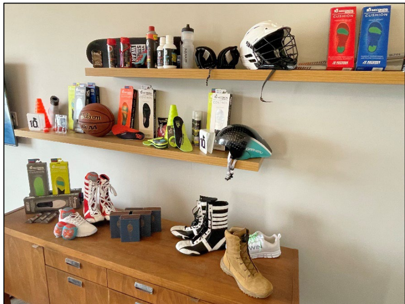
Display showcasing the variety of products that use Hickory Brands, Inc. manufactured materials within their finished products, including many products used in outdoor recreational pursuits.

Of the total $14.5+ billion impact that outdoor recreation contributes to the state’s annual GDP, more than $2.3 billion of that is contributed from manufacturing. This sector employs over 7,600 people. 14 The existing industrial base, active economic development organizations, and business support that is available locally situates Hickory in a great circumstance to develop and grow outdoor recreation product manufacturing.