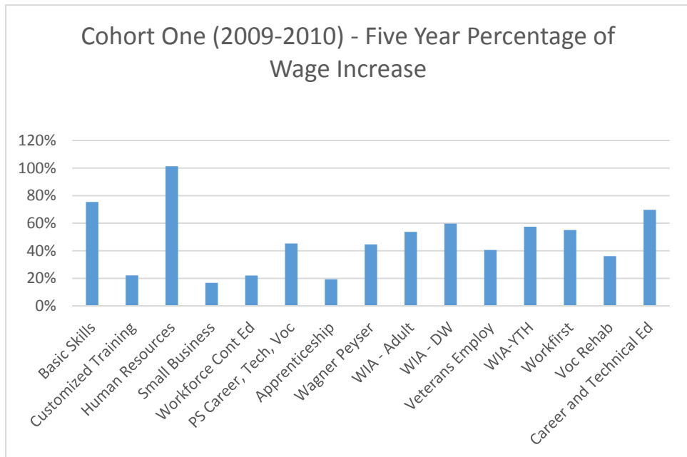
Exhibit 3 – Cohort One (2009-2010) Five-Year Percentage of Wage Increase by Program

This year we are able to report on the five-year wage and employment trends for the base year cohort one (2009-2010). While each program does not specifically focus on wage increase as a goal, several programs have a significant impact on the participant’s overall wage over time. See Exhibit 3, which shows percentages of wage increases by program for cohort one (2009-2010) over a five-year period. In addition, we can see in Exhibit 4 that those participants that were tracked as part of the 2009-2010 cohort increased their wages by 30% overall by 2013-2014. Each year, cohort one (2009-2010) gained at least a 4% wage increase over time.