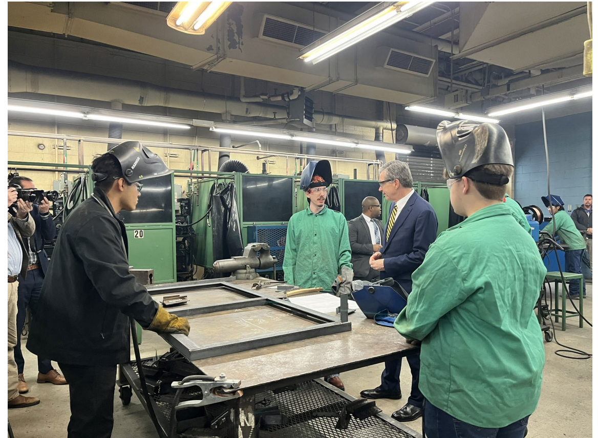
Caterpillar Pre-Apprenticeship Training in Welding, Central Carolina Community College