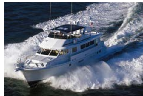
North Carolina's marine industry will be well-represented at the Miami International Boat Show next month