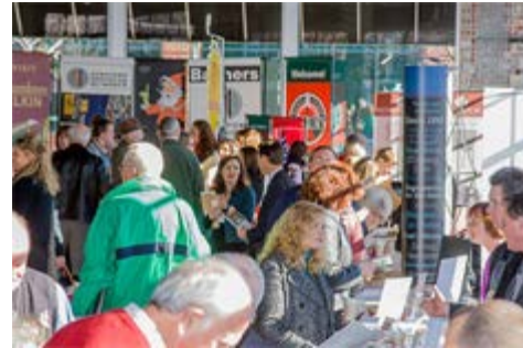
Last year's N.C. Main Street Conference in Salisbury

"We appreciate the trust and confidence the governor placed