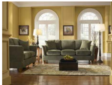
Simplicity Sofas' products

Gildan to bring 170 jobs to Salisbury with new textile plant ( The Business Journal of the Greater Triad , Dec. 19)