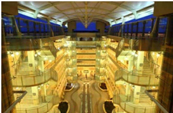
The parking atrium at RDU

McCrory names ex-head of Charlotte Chamber to cabinet ( The Charlotte Observer , Jan. 3)