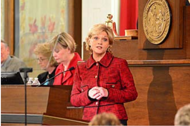
Governor Perdue addresses the General Assembly in her State of the State address.