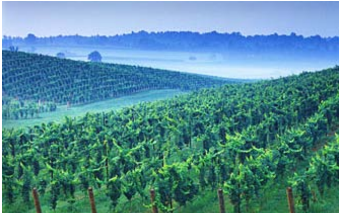
Shelton Vineyards in the Yadkin Valley