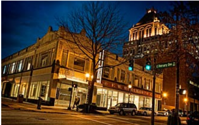
The International Civil Rights Center & Museum in Greensboro