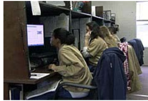
Workers in the Division of Tourism, Film and Sports Development's 1-800-VISITNC call center

To find out more about the N.C. Wine & Grape Council, and to sign-up for its consumer e-newsletter, "Uncorked," click here .