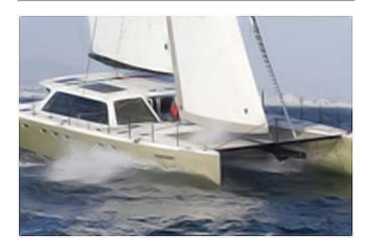
A Gunboat catamaran