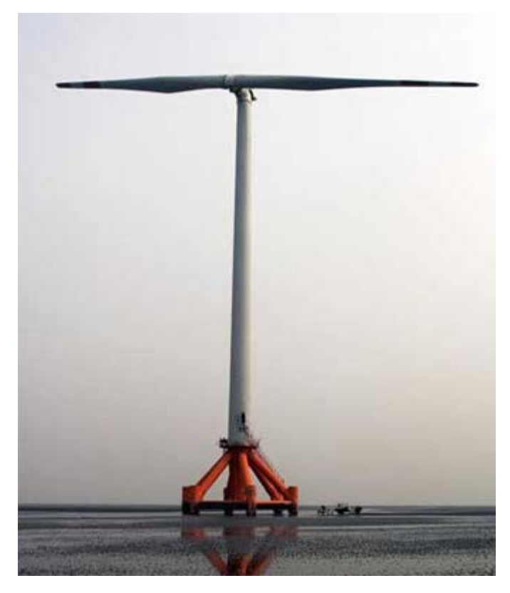
One of the Ming Yang's two-blade, energy-efficient wind turbines