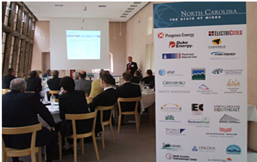
Commerce developers meet with members of the Heilbronn and Wertheim chambers of commerce and industry March 16 at Kloster Bronnbach in Wertheim, Germany.

Read more about Community Development Block Grants.