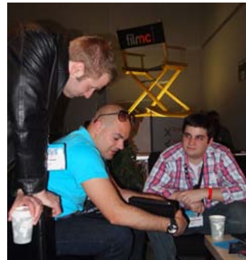
Filmmakers and producers congregate at the filmmakers lounge at the SXSW Festival.

Perdue: Rail agreement to bring N.C. 4,000 new jobs ( The Citizen-Times - Asheville, March 22)