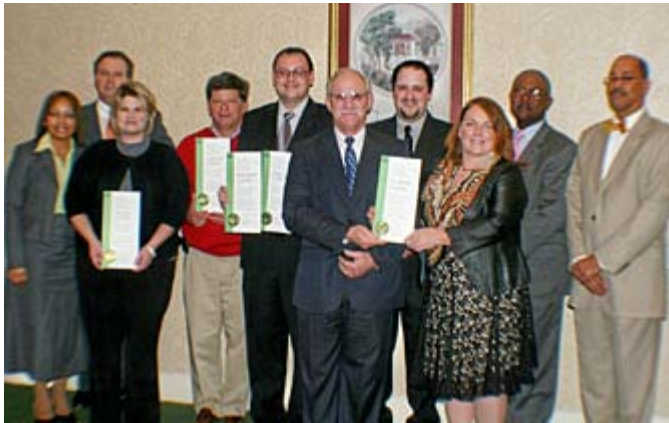
Representatives of the N.C. Dept. of Commerce are shown with participants in the 21st Century Communities Program.