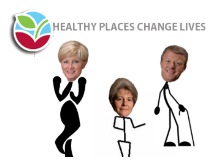
A lighthearted fitness promotion featured Southeastern Health's executive team - engaged leaders are an important factor in company wellness initatives