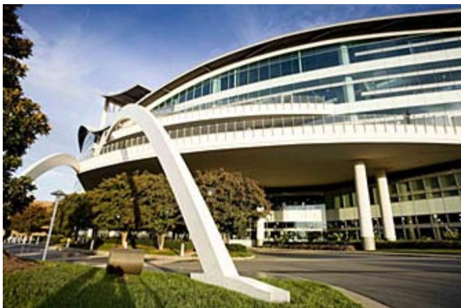
The High Point Market is the largest furnishings industry trade show in the world, bringing more than 85,000 people to High Point every six months.