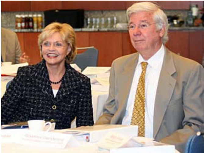
(Left-right) Gov. Bev Perdue and former Maryland Gov. Parris Glendening at Kickoff for "The Governors' Institute for Community Design"

See the Jobs and Economic Recovery Fact Sheet