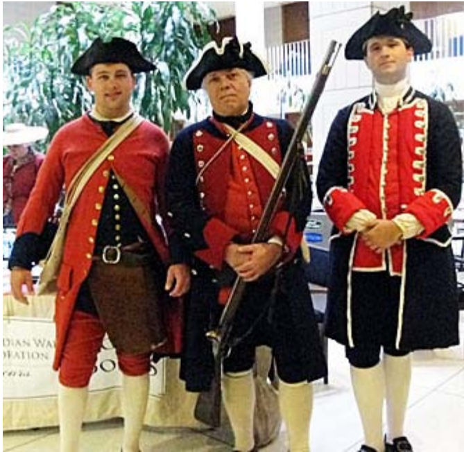
Reenactors from the Fort Dobbs Historic Site in Iredell County are shown at the Legislative Building during N.C. Travel and Tourism Day.