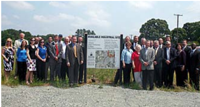
Local and state officials from the public and private sector are shown at the CIS ceremony in Burlington.