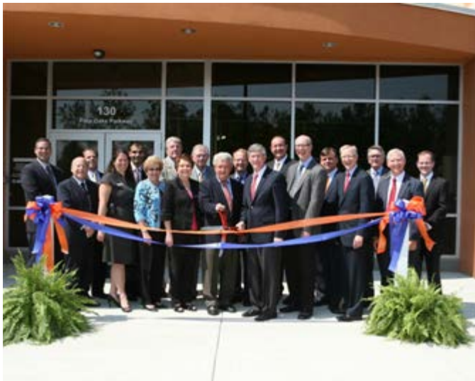
Local, state and BD officials at the Four Oaks grand opening

Last week, Forbes released a new Best Big Cities for Jobs list , in which 398 cities were analyzed for recent growth trends, mid-term growth, long-term growth and the region's momentum. The Raleigh-Cary area, which was ranked 14th in 2011, broke the top-ten on this year's list, moving up to number seven. Year-on-year employment growth for the capital area was 2.2 percent. See the Forbes Best Big Cities for Jobs lists. Read more.