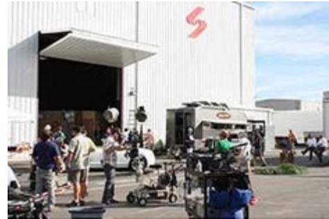
Film crew outside a soundstage at EUE/Screen Gems Studios in Wilmington