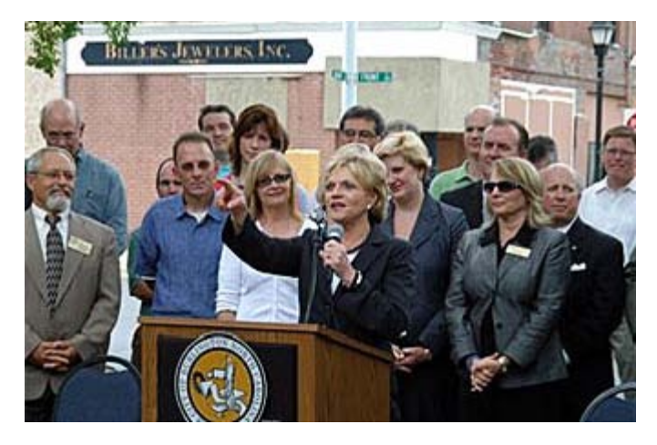
Gov. Bev Perdue visits Burlington, one of the eight Main Street Solutions grant award winners