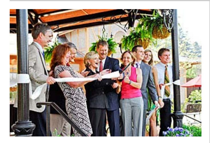
Gov. Bev Perdue helps cut the ribbon during the opening of Antler Hill Village at Biltmore.