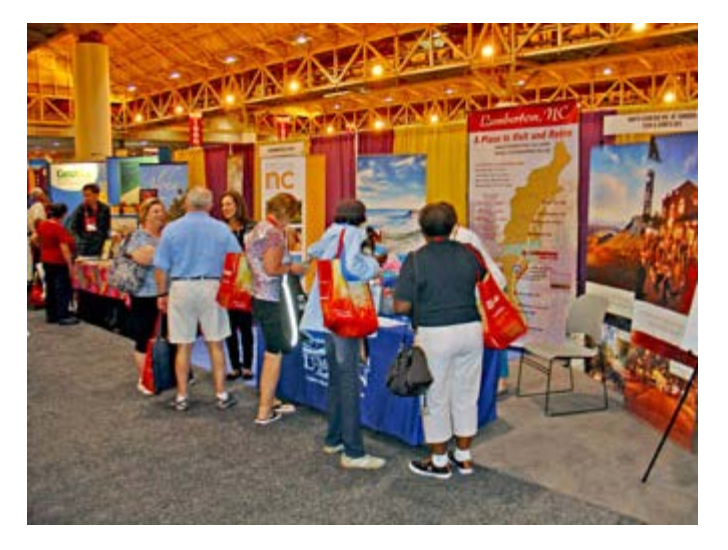
The North Carolina booth drew a large audience during the 2012 Life @50+