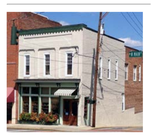
A renovated building in downtown Mount Airy