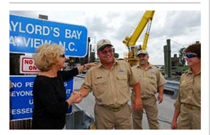
Gov. Bev Perdue visits with ferry operators at the Bayview-Aurora ferry.