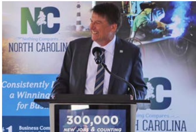
Governor Pat McCrory speaks at a ceremony announcing Avadim's Buncombe County expansion.