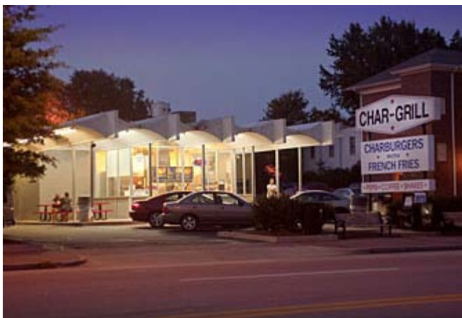
Char-Grill on Hillsborough Street in Raleigh