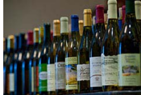
Wines from North Carolina wineries await judging at the N.C. State Fair Wine Competition.

LaHood spoke with about a dozen local elected leaders and business officials at the transpark's work force training facility before touring the Spirit AeroSystems facility and the