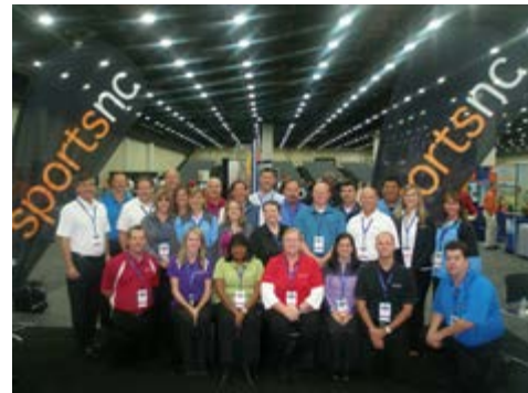
N.C. delegation at TEAMS