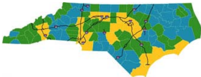
Tier 1 counties are in blue, Tier 2 in green and Tier 3 in yellow.

been made improving infrastructure and the availability of buildings and sites in choosing these locations. Read more.