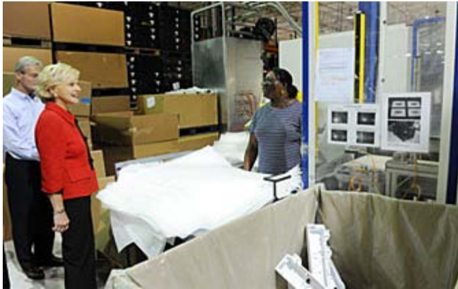
Gov. Bev Perdue speaks to an employee at PAS in Washington, N.C., during a tour of the plant.