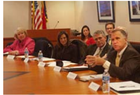
House Speaker-Designate Thom Tillis (far right) addresses members of the N.C. Travel and Tourism Board on Dec. 7.

The PAS Group is a worldwide manufacturer of cable and panel systems for household appliances with facilities in Germany, Poland, Turkey, Mexico and the United States. Subsidiary PAS USA Inc.'s manufacturing facility in Washington, N.C. currently employs 137. The new investment will enable PAS USA to win a new supply contract for 250,000 dishwasher panel systems with a major home dishwasher brand. Manufacturing includes injection molding, printing, high speed milling, assembly and electronic testing.