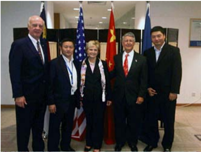
Lenovo, in Beijing.