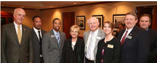
TIMCO unveils new Davidson County facility ( The Business Journal of the Greater Triad , Nov. 7)