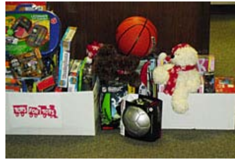
Toys donated by the Community Development Division's Raleigh office will be given to Toys for Tots.