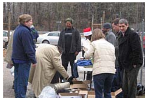
Division of Workforce Development staff volunteer at the Hallelujah Soup Kitchen.

N.C.'s Eastern Region will publish an Economic Development Review, reinforcing the area's favorable quality of place while also targeting prospective residents, employees, businesses and visitors. The magazine will be distributed by N.C.'s Eastern Region as well as through key local businesses, trade shows, conferences and events throughout the year.