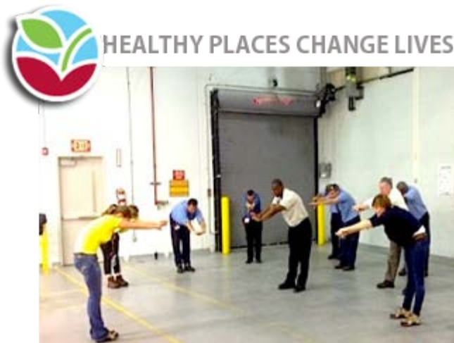
DSM-Dyneema employees take a break to stretch. This is routine at the manufacturing plant where the team recognizes the importance of exercise and healthy eating habits

The unit's many accomplishments include the "Hire a Vet Week" job fair in November 2013 and the "Good Jobs for Vets" program, begun in early 2014. Since that program's beginning, 42 veterans have registered, 11 job fairs have been held and four participants have begun jobs with others soon to follow.