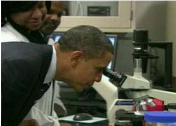
President Barack Obama looks through a microscope Dec. 6 at Forsyth Technical Community College.