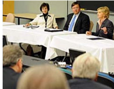
Gov. Bev Perdue seeks input from business leaders.

Obama highlights biotech jobs in N.C. visit (N.C. Center for Biotechnology)